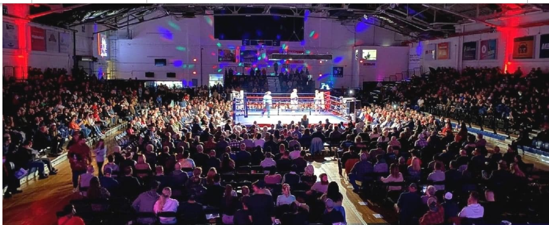
All-Star Boxing at the Portland Expo on November 6, 2021.