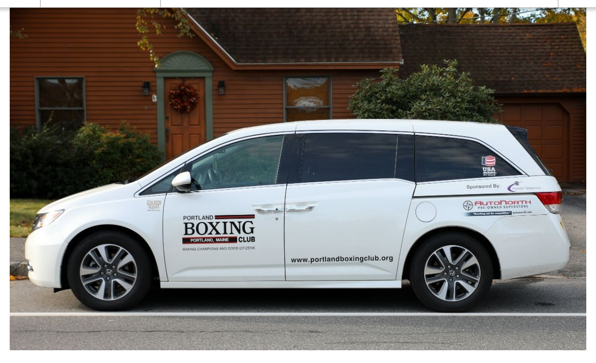
The Portland Boxing Club van is searching for van sponsors. Sponsor logos are prominently featured on the van which is used to transport team members to events across New England.