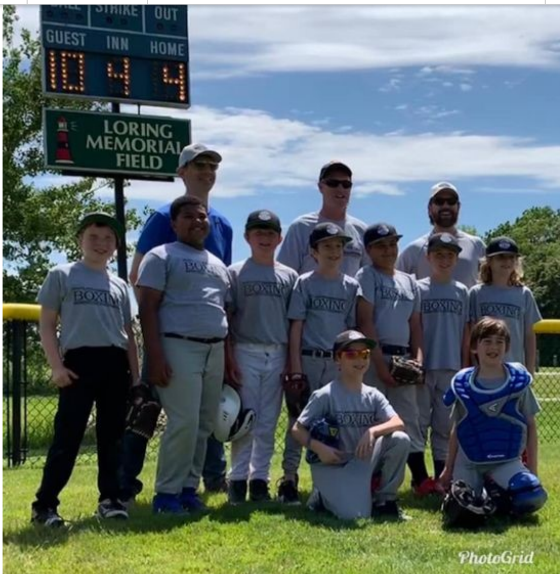
Portland Maine 8/9 Little League 2019 Championship Team.