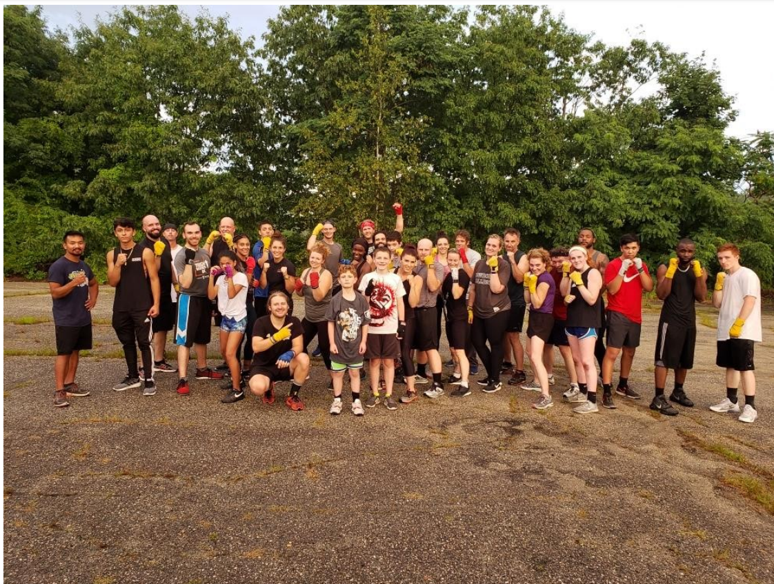
Portland Boxing Club 2019 Annual Summer Boot Camp participants and coaches.