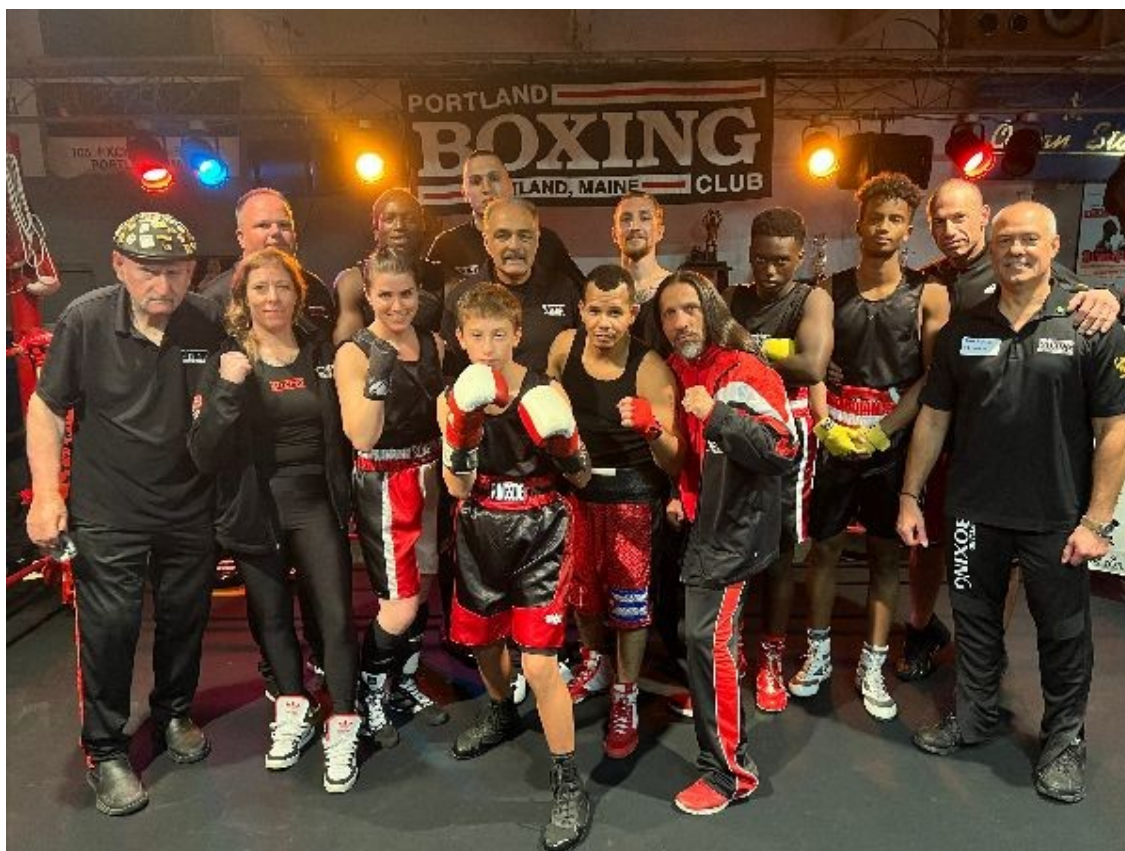
Portland Boxing Club's 2021-2022 Boxing Team and Coaches.