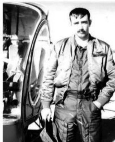
Chief Warrant Officer 4 Active Duty Vietnam 1967 - 1968 and 1969 - 1970 Helicopter Pilot First Air Cavalry