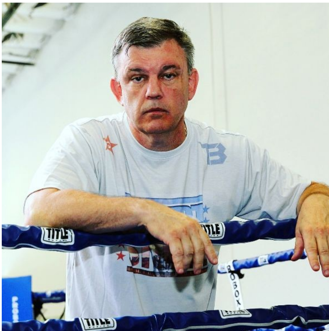
Special guest for the All-Star Boxing event, Teddy Atlas.

Restaurant. Tickets will also be available at the door.