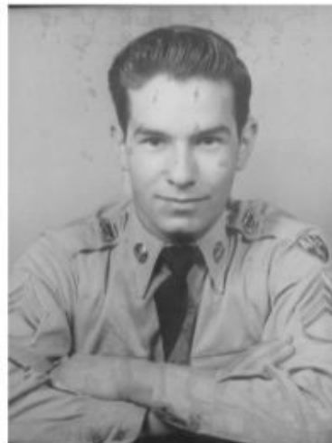
Enlisted in the Army at age 17 to serve in the Korean War