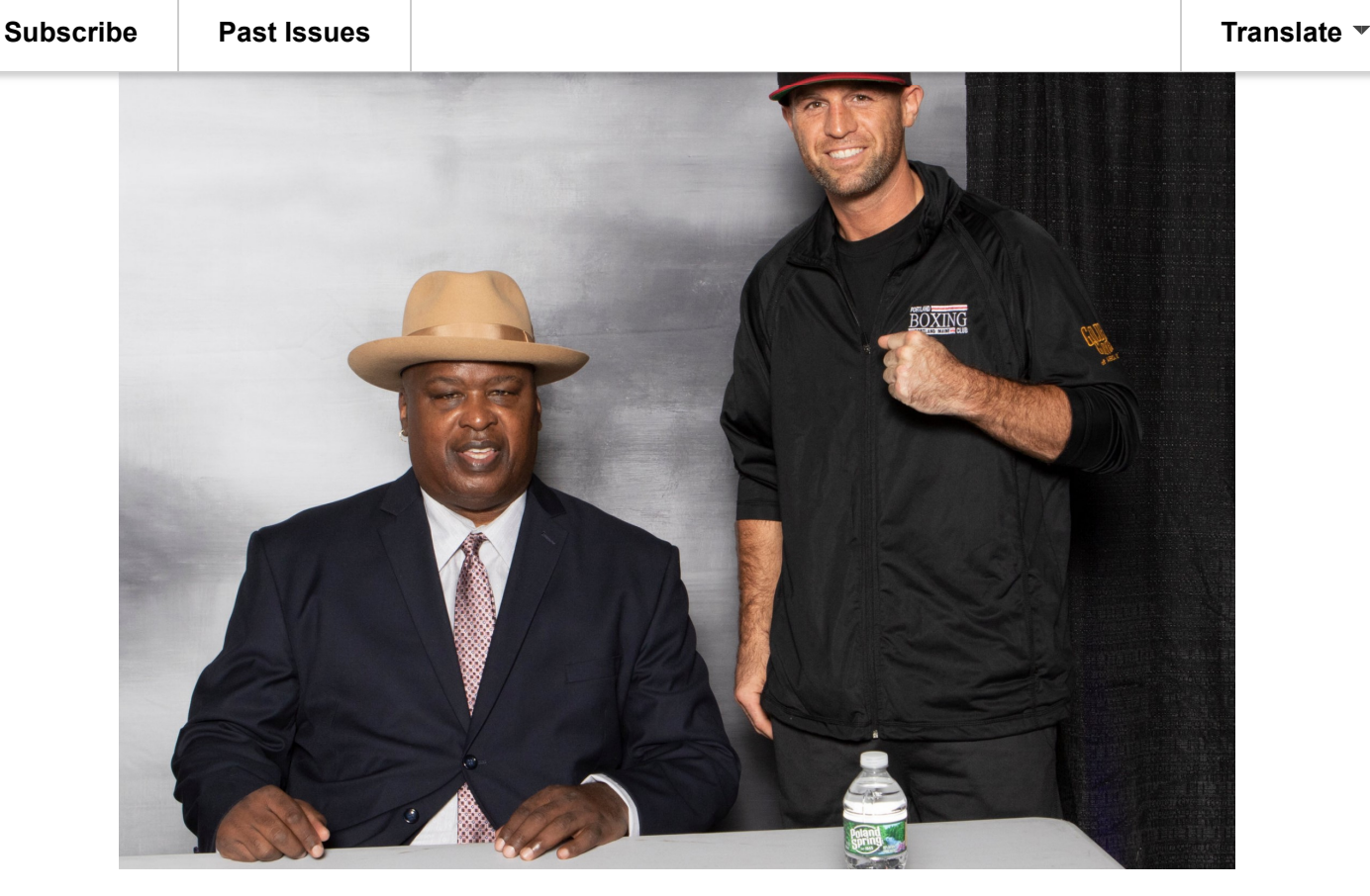
Photos with Buster Douglas and Rob Ninkovich are available for download here: <u>https://www.brucehaskellphotography.com/proofing/portland-boxing/nov-12th</u>